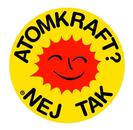
Figure 1. The OOA's smiling sun logo with the text "Nuclear power? No thanks". Reproduced with permission from OOA.

Riding my bike with my kids to school I notice a round sticker on a door we pass. "5G? No thanks" it says, the question curving above and the answer below something round in the center. Arriving to the city of Örebro, Sweden for the Nordic Conference for Rhetoric Research 2023, prepared to give a paper on the rhetoric of the Danish anti-nuclear power movement I notice a mural depicting a red Covid-19 virus on a yellow background and the words "Corona? No thanks" (see figure 3/F below). Taking part in an idea generation meeting for a new local nature, arts and music festival I find myself discussing a logo on a yellow background, a cross section of a tree trunk in the center, the annual rings forming two barely visible eyes, a smile and the words "Festival name? Yes thanks". Examples are legion. The Danish public abounds with variations of this form and phrase. It can be traced to 1975 when the Danish grassroots organization OOA, Organisationen til Oplysning om Atomkraft (Eng. Organization for Information on Nuclear Power) designed their "smiling sun logo" (see figure 1) – and it is ever evolving.