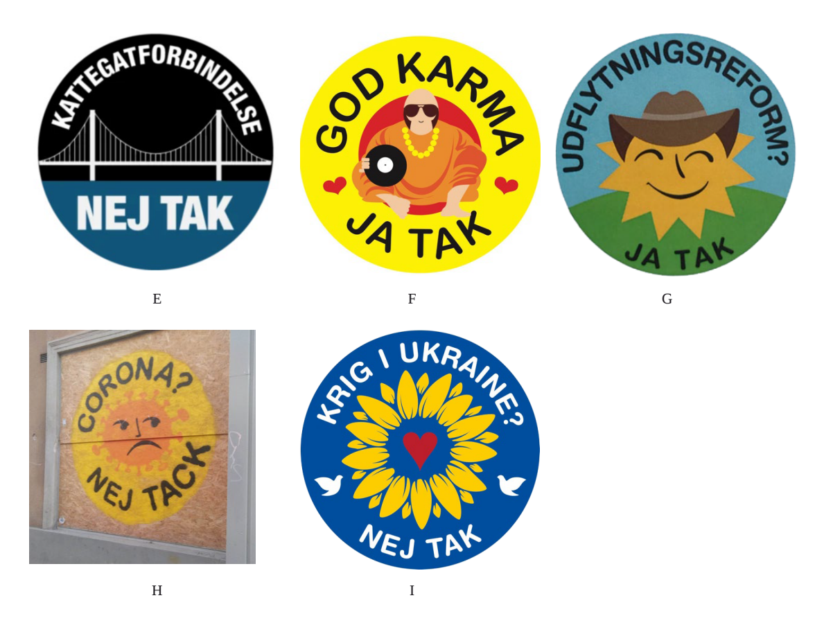
Figure 3. Examples of new versions of the logo currently in circulation. E : "Kattegat connection No thanks". Logo protesting planned construction of a bridge over the sea of Kattegat. Reproduced with permission from the group "Kattegat Nej tak". F : the logo celebrating deceased Copenhagen DJ and media personality, Master Fatman [trans. "Good karma Yes thanks"]. Reproduced with permission from creator of the sticker, owners of the café Kaj – din ven i solen. G : the logo is commenting on university policy by the Danish government to move some university departments out of the bigger cities, hanging on campus of UCPH, 2022 [trans. "Relocation reform? Yes thanks"], creator unknown. H : a mural commenting on Covid-19, Örebro, Sweden, 2022, artist unknown. I : "War in Ukraine? No thanks". Reproduced with permission from creator, Lotte Sørensen.